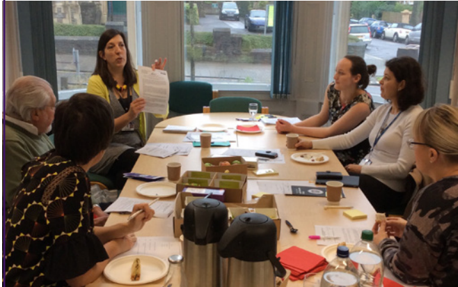
A PAG meeting, with BRC researchers