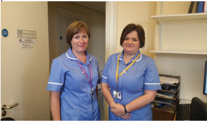
Members of the Paediatric Research Nurse Team at UH Bristol

We conduct research that we believe makes a real difference to people. Not only do we want to improve ways of looking after patients with heart disease, we also want to let people know about the important breakthroughs we are making.